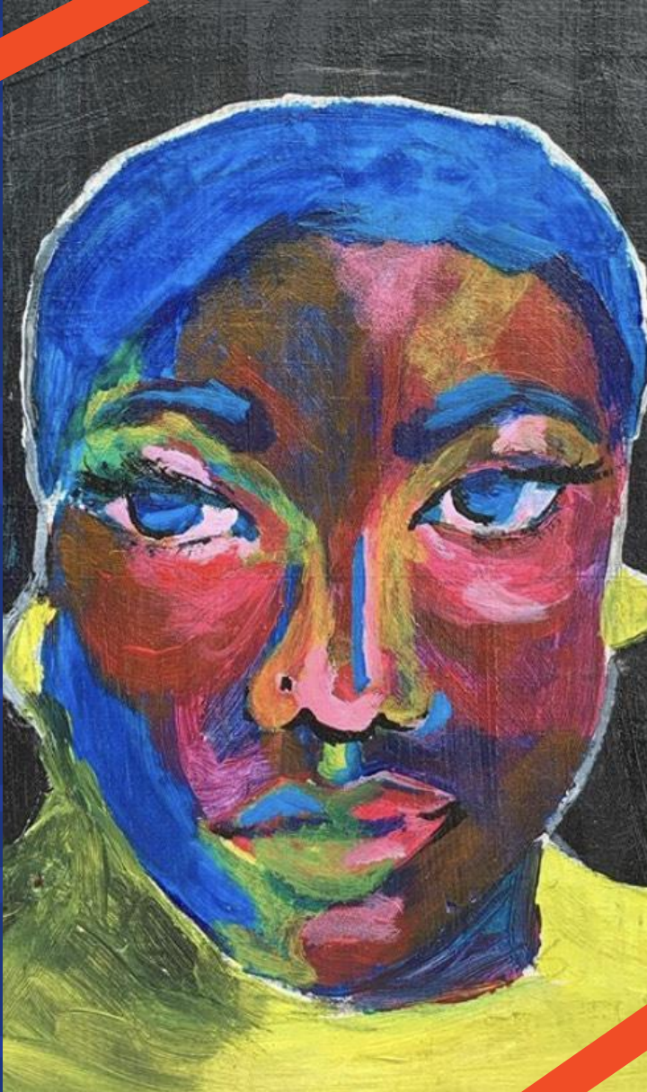
Illustration by Ladasia Bryant, age 19