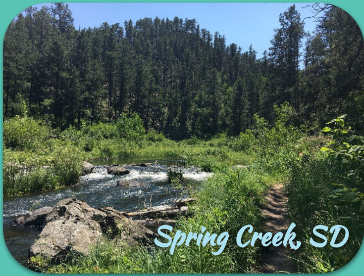
Spring Creek, SD