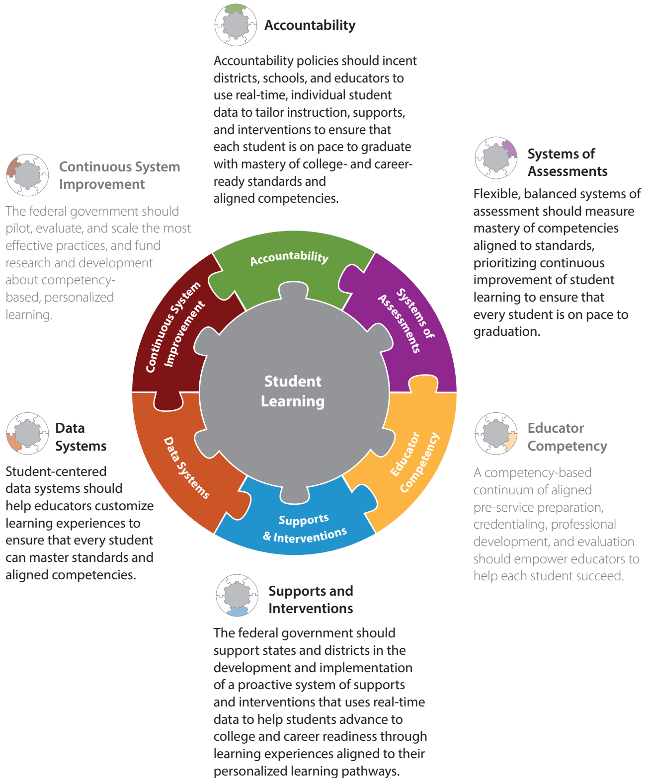
FIGURE 2: Enabling Policy Framework for Competency Education