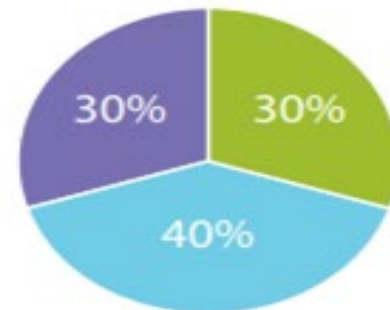
How Scores are Weighted for High Schools and Districts